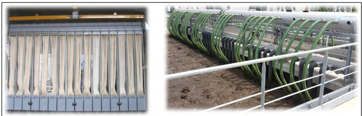
Figure 2. Membrane rack (on the left) and MOS tank in operation (on the right).

The membrane operating system (MOS) comprises eight membrane tanks fed by gravity from a common channel, in order to be able to feed each MOS tank with any biological tank. The membranes are a monolithic hollow fibre type made from PVDF with nominal pores 0.04 microns arranged into modules. Membrane modules are installed into a rack with 41 racks per tank, the total filtration area is approximately 150,000 m 2 (MEMCOR® membranes type B40N).