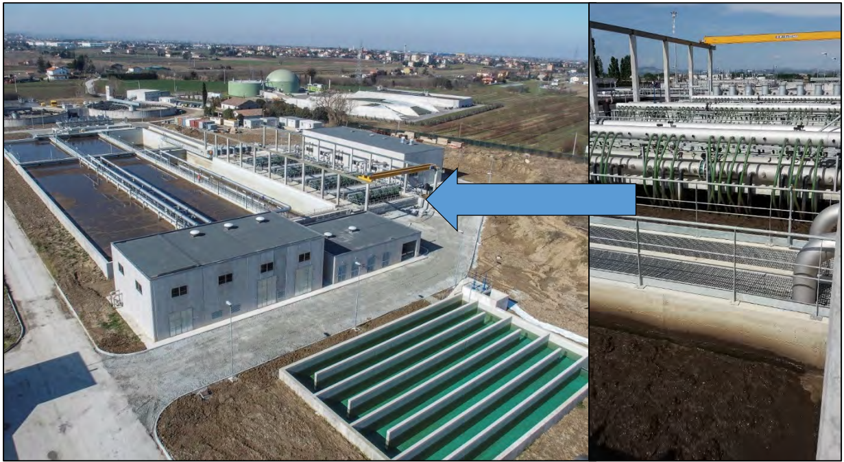
Figure 1. The Rimini Santa Giustina MBR plant.

The membrane operating system (MOS) comprises eight membrane tanks fed by gravity from a common channel, in order to be able to feed each MOS tank with any biological tank. The membranes are a monolithic hollow fibre type made from PVDF with nominal pores 0.04 microns arranged into modules. Membrane modules are installed into a rack with 41 racks per tank, the total filtration area is approximately 150,000 m 2 (MEMCOR® membranes type B40N).